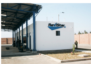
Opus first vehicle inspection station in Ica, Peru, operated under the name ReviStar