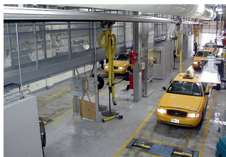
The New York City Taxi and Limousine Commission Woodside inspection facility