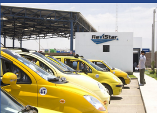
Opus first vehicle inspection station in Ica, Peru, operated under the name ReviStar