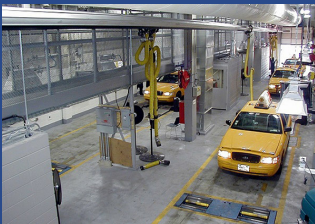
The New York City Taxi and Limousine Commission Woodside inspection facility